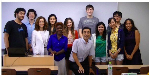
Noguchi sensei with students

Traditional communicative approach tries to train only two abilities, “understand and can do” in just two areas, “language and culture,” i.e., “□” marked parts. However, as you can see, the key concepts of “Comprehensive Communication Ability” are quite wide. As well as the “□” marked parts, whole “□” parts are covered. It is really hard to cover the above all only if we just use an existing textbook. We need to think up some project work type learning activities. The following is a project work conducted in my classes in summer session this year: July 26 th to August 15 th in 2012.