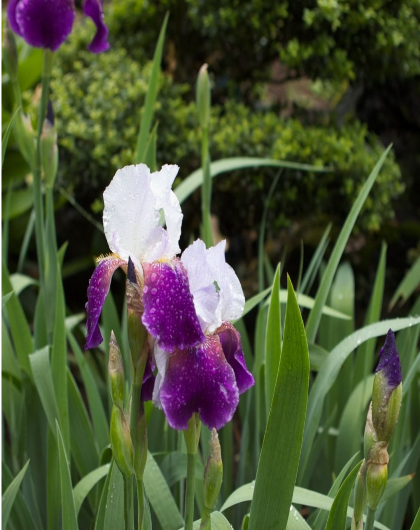
Irises growing in one of the beautifully kept gardens on a backstreet of Matsumoto.