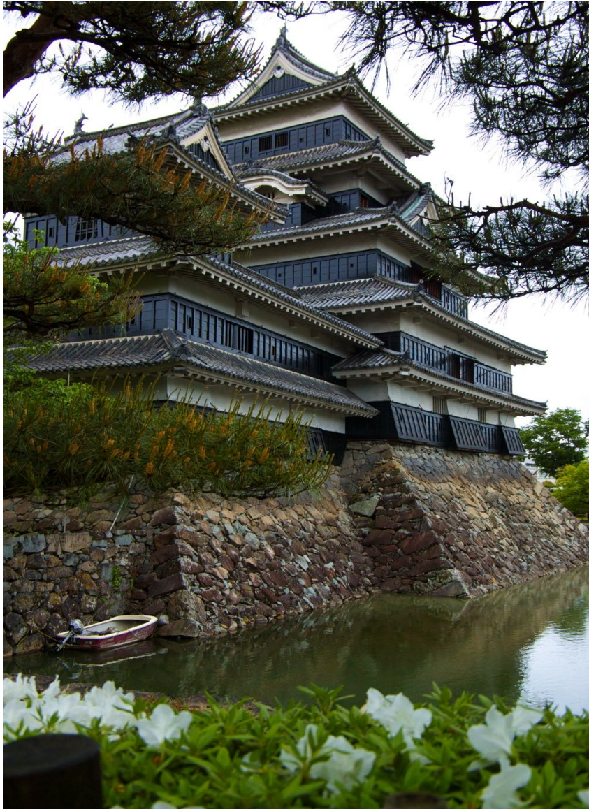
Photo taken at the entrance gate of the castle. The lower walls of the castle have space left between them and the stone wall so that stones can be dropped on the heads of enemies attempting to scale the castle wall. [Samurai apparently sometimes had to make a quick retreat by motor boat. ]